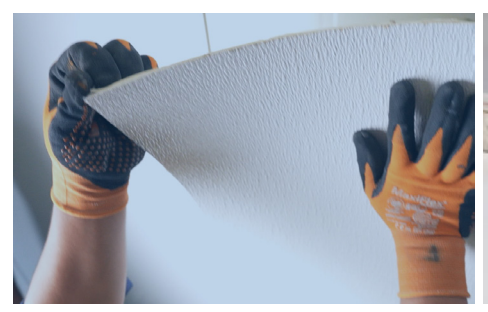
Glasbord® with Surfaseal® Self Adhesive peel and stick panels (Hygibreak®)