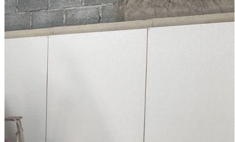
Glasbord® with Surfaseal® Sandwich Panels (Hygispan®)