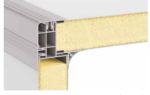
Glasbord® with Surfaseal® Modular Panels (Hygicold)