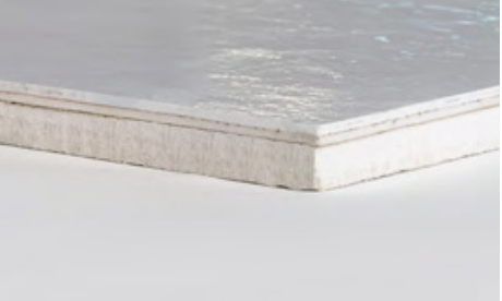
Glasbord® with Surfaseal® laminated on Rigid Board (Hygimat)